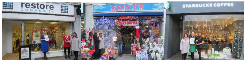
Last year's winners

2016 Christmas Window Competition. The Town Council invites all Loughton's businesses to decorate their shop windows in a Christmas-themed design for automatic entry to this special Christmas competition. More.